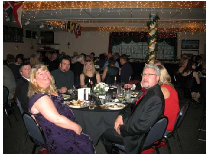
A happy table at the New Year's bash

Windermere Real Estate/Shoreline 900 North 185th Street Shoreline, Washington 98133