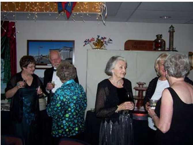
Everyone at the New Year's eve party had plenty of time to mingle!