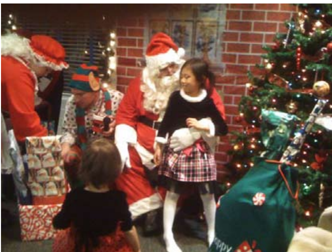
Croasdill grandkids visiting Santa

February 17th — Seattle YC March 11th — Poulsbo YC April 13th — Day Island YC May 18th — Rainier YC